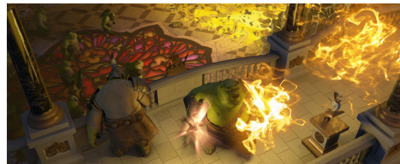
Figure 4: A final frame showing various stages of the effect

Another stereoscopic challenge we solve with the Filigree Effect is the efficient rendering of rays of light. Using a light as a source, rays are cast out through a particle set outwards. Along each ray, we sample a point and place a new particle with an opacity and radius falloff. This effectively creates a fast, art directable shaft of light that works both in 2D and stereoscopically (Fig. 3).