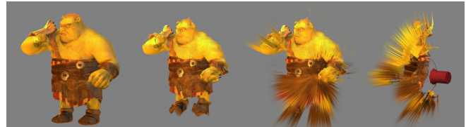
Figure 3: Particle based character render with morphing and light rays

To morph the characters using a true volumetric representation is too costly to compute and simulate, especially over multiple characters. To create a more efficient representation, camera depth maps are used to place particles in world space to recreate the character using a more sparse dataset. Then the beauty pass is used to shade each particle. This allows the artist to work quickly with an optimized set of data that still renders the character faithfully in 3D (Fig. 3).